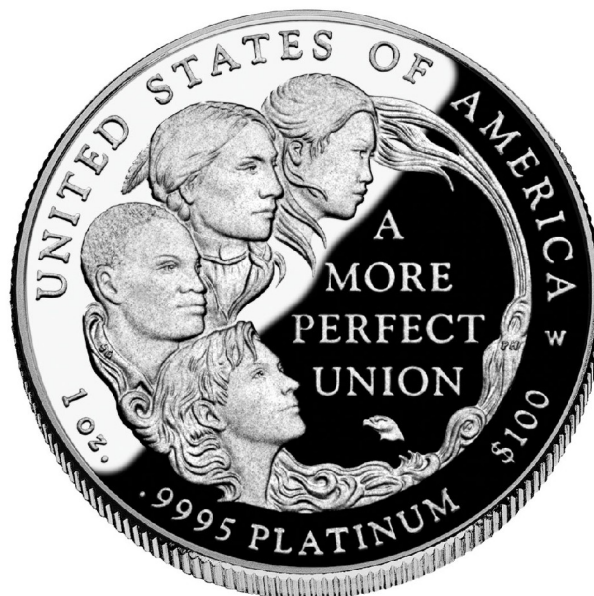
Reverse of US 2009 Proof Platinum Eagle.