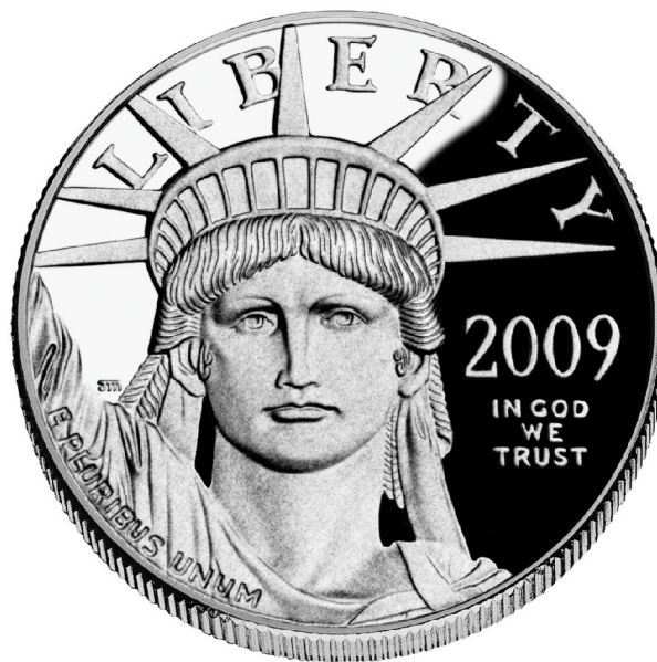
Obverse of US 2009 Proof Platinum Eagle.

units. The coin's price will be based on the United States Mint's pricing structure for numismatic products containing precious metals (on 3 December, the price was $1,792).